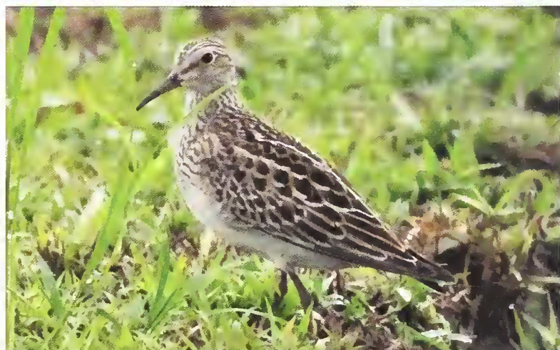
Plate 6. Juvenile Pectoral Sandpiper Calidris melanotos , International Rice Research Institute near Los Baños, Laguna, 10 October 2013.